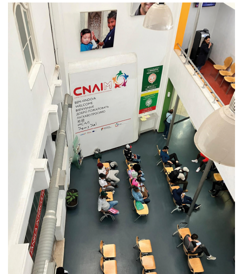
CNAIM – National Support Centre for the Integration of Migrants in Lisbon @IOM Portugal